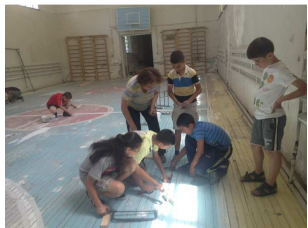
1 IMPACT Club members implementing a community service-learning project in their school.

WV has produced an IMPACT Club Project Model Guidance Document and IMPACT Club Handbook to provide support to project teams beyond the trainings. The Handbook, in particular, provides detailed guidance on adapting and implementing an IMPACT Club project.