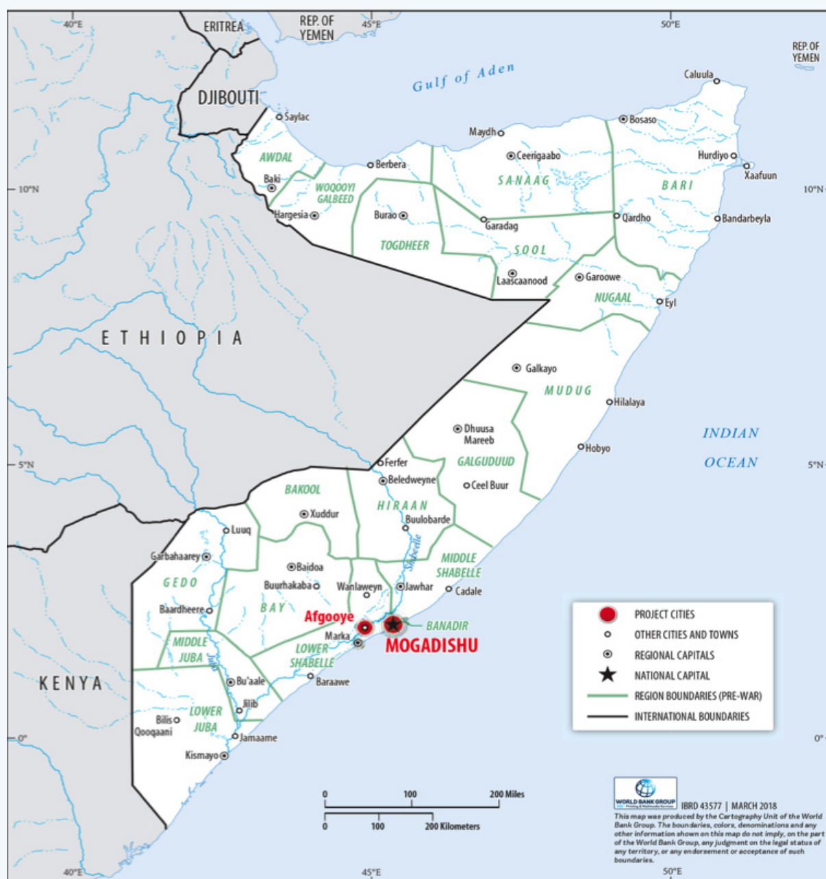
Figure 1 Map of Somalia indicating the location of project

has a large displaced population, and the city is largely accessible to both civil society and government. Young people there are more likely to have been exposed to peacebuilding efforts and to have had a chance to be engaged. Afgoye, on the other hand, is one of Mogadishu's 17 districts; it is relatively close to the capital and thus accessible for research purposes, but is primarily rural. Communities in Afgoye are considered similar to other rural communities in of security reasons. This was important because Somalia is primarily rural—Afgoye therefore provided a more representative sample. Under the security circumstances that prevailed in Somalia at the time of the study, this selection was the most feasible while also being methodologically sound.