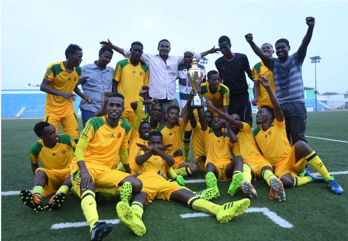
Players from Banadir Football Club celebrate their victory over Gaadiidka Football Club in a match organized to mark the International Day of Peace at Banadir Stadium in Mogadishu, Somalia on 21 September 2017.

Youth have concrete ideas for promoting peace in Somalia. These ideas are based on their own experience and priorities, and provide a basis for broader recommendations. Respondents' ideas on how to best engage youth also show that there are clear and concrete steps to engaging young people in peacebuilding that are practical and can provide a way forward.