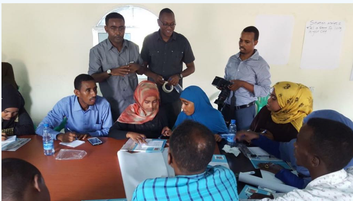
Training of Somali youth in life and job skills

Peace education can have positive impacts in Somalia. Many respondents specifically mentioned the need for education that can lead to cohesion and peace. Peace education should be offered at two levels, both within the school system and at the community level. The latter may involve NGOs, religious institutions, and other entities. These programs should employ evidence-based, active learning techniques and be culturally and contextually appropriate, focusing on specific knowledge, attitudes, and practices related to peacebuilding. Above all, they should contribute to youth empowerment and the emergence of youth-led community and local development initiatives.