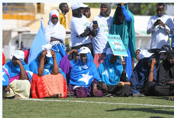
Residents of Mogadishu city attend celebrations to mark the Somalia National Youth Day at Banadir stadium in Mogadishu, Somalia on May 15, 2017. The day marks the founding of the Somali Youth League (SYL), which was Somalia's first political party founded in 1943 and spearheaded the struggle for independence.

Conflict and insecurity have resulted in limited opportunities for Somalis and youth in particular. Youth unemployment stands at 75 percent. 50 This is perceived as contributing to young Somalis' vulnerability to illegal migration, organized crime, and/or violent extremism. 51 The UN–Somali federal government's report on their joint program on youth employment found that "youth employment is without question one of the critical challenges facing Somalia on its path to stability and economic recovery." 52 It also presented available data—for example, from the International Labour Organization (ILO)—that indicate that Somalia has one of the highest rates of joblessness in the world, in particular among youth. The ILO's labor force survey estimates the youth unemployment rate at 22 percent for selected districts in southern Somalia. 53 However, for most African countries, including Somalia, measures of unemployed youth are less relevant than measures of employed youth. Among the poor, few can afford to be unemployed, as there is typically no social protection for unemployed persons. Focusing on the unemployment rate thus fails to take into account this reality. As a result, vulnerable employment and working poverty are widespread; the ILO estimates underemployment to be at 25 percent, without taking into consideration the widespread phenomena of "discouraged