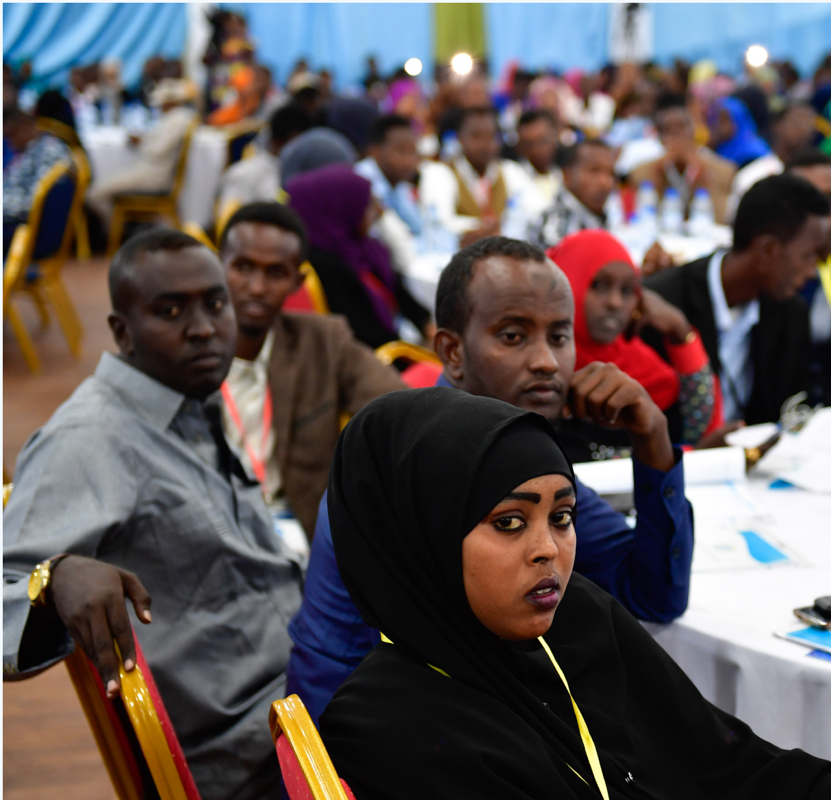
Participants attend the Somali National Youth Conference held in Mogadishu on December 17, 2017.